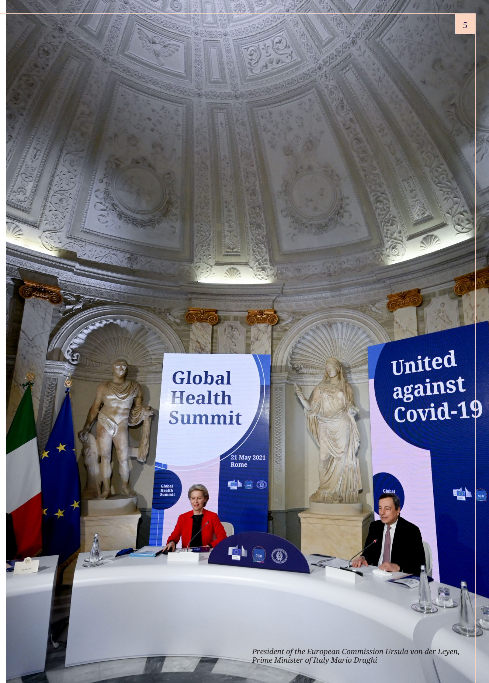
President of the European Commission Ursula von der Leyen, Prime Minister of Italy Mario Draghi

Welcome the World Health Organization's (WHO) designation of 2021 as the Year of Health and Care Workers, and reaffirm our full support for the leading and coordinating role of the WHO in the COVID-19 response and the broader global health agenda.