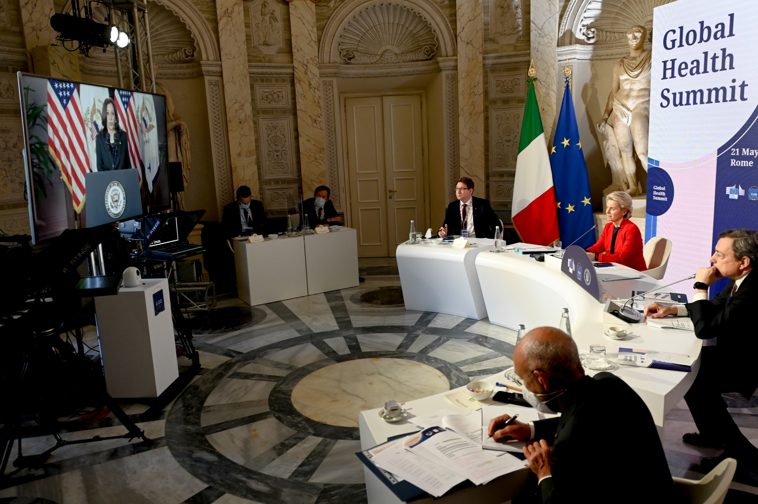
President of the European Commission Ursula von der Leyen, Prime Minister of Italy Mario Draghi and Vice-President of the United States Kamala Harris